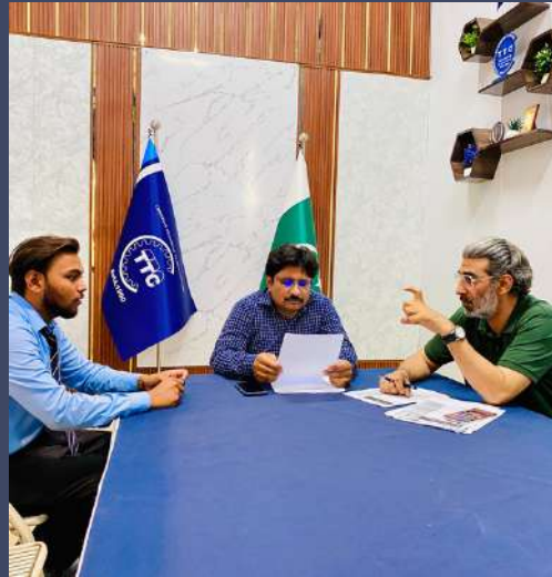
CF SMART TECHNOLOGIES (Jobs for MT, ET & ELTR)