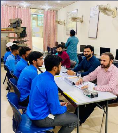
STORM FIBER (Jobs for CIT, ET, ELTR)