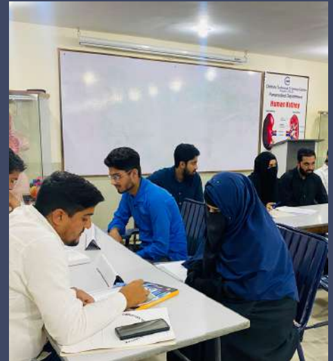
SAB & AN DESIGN STUDIO (Jobs for ARCH, CIVIL)